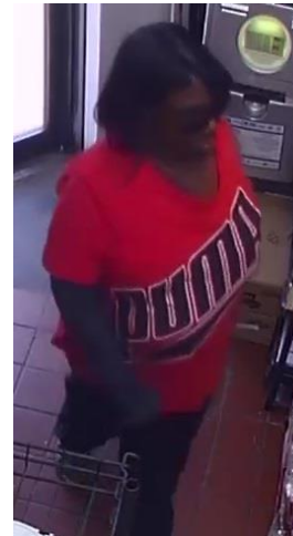
Suspect # 2 Upland Market