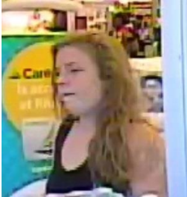
Suspect # 1 Rite Aid