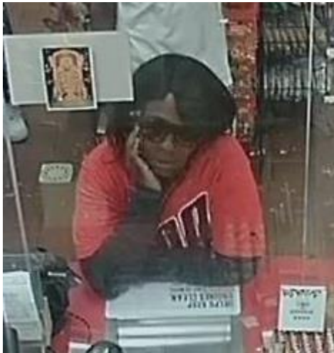
Suspect # 2 Citgo